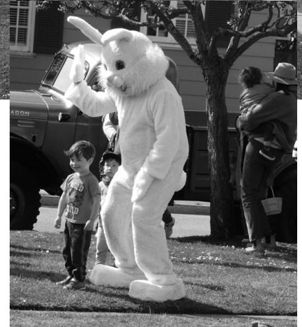
Photos from the ITHA Easter Egg Hunt April 2 at the Sundial.