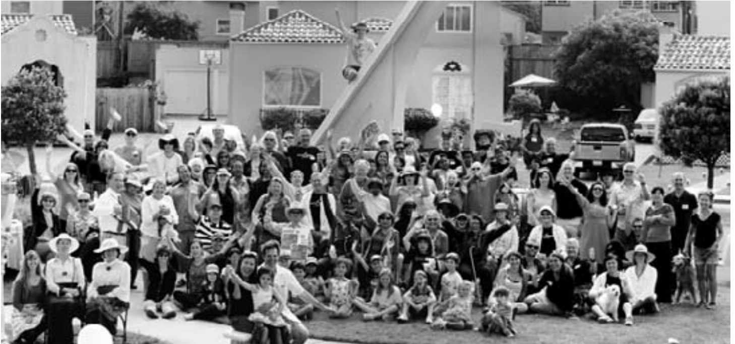
Centennial Fall picnic 2013