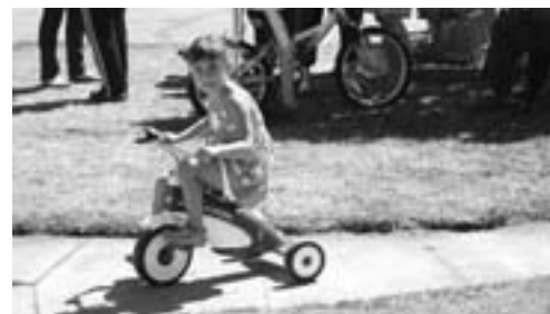
Photo from previous picnic

Each year, the Planning Department responds to over 500 inquiries pertaining to potential land use violations. In most cases, investigation of code violations happens when a citizen reports a potential violation. Examples of violations include construction/demolition, landscaping maintenance, building misuse and inappropriate parking. The types of violations that are typically reported are included on the planning department’s enforcement code violations list: http://sf311.org/planning-code-typical-minor-violations-400295